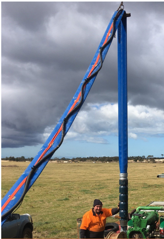
Well-snaked power cable secured with Cable Ties

Cable Ties are a quick and easy way to secure your power cable to Flexibore, our flexible rising main. Flexibore is manufactured with a coloured strip that creates loop attachment points to secure your power cable. Depending on the thickness of the cable, one or two Cable Ties are required at each loop point.