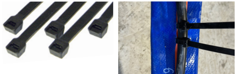
Heavy-duty polypropylene Cable Ties

Although Cable Ties are best suited to FB100, they are also suitable when securing smaller diameter power cables to FB250 & FB150 to depths of up to 150 metres. Refer to our Flexibore User Guides for the best results.