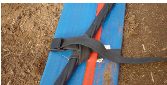
Polyurethane (PU) straps

Flexibore® has a strip with loop attachment points to secure your power cable using the recommended method.