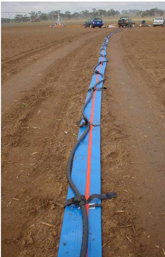
Power cable secured with PU straps

Flexibore® is manufactured with a coloured strip, making loop attachment points to secure your power cable. Polyurethane (PU) straps are the suggested attachment method for longer power cables over 150 m deep instead of cable ties.