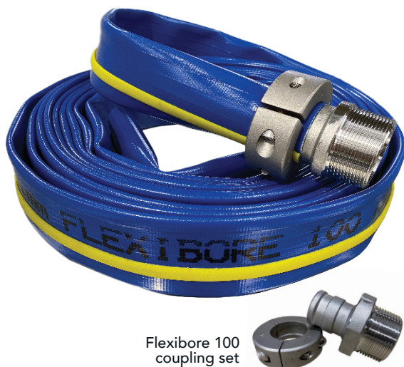
Flexibore 100 coupling set