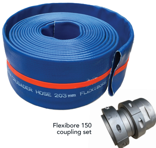
Flexibore 150 coupling set