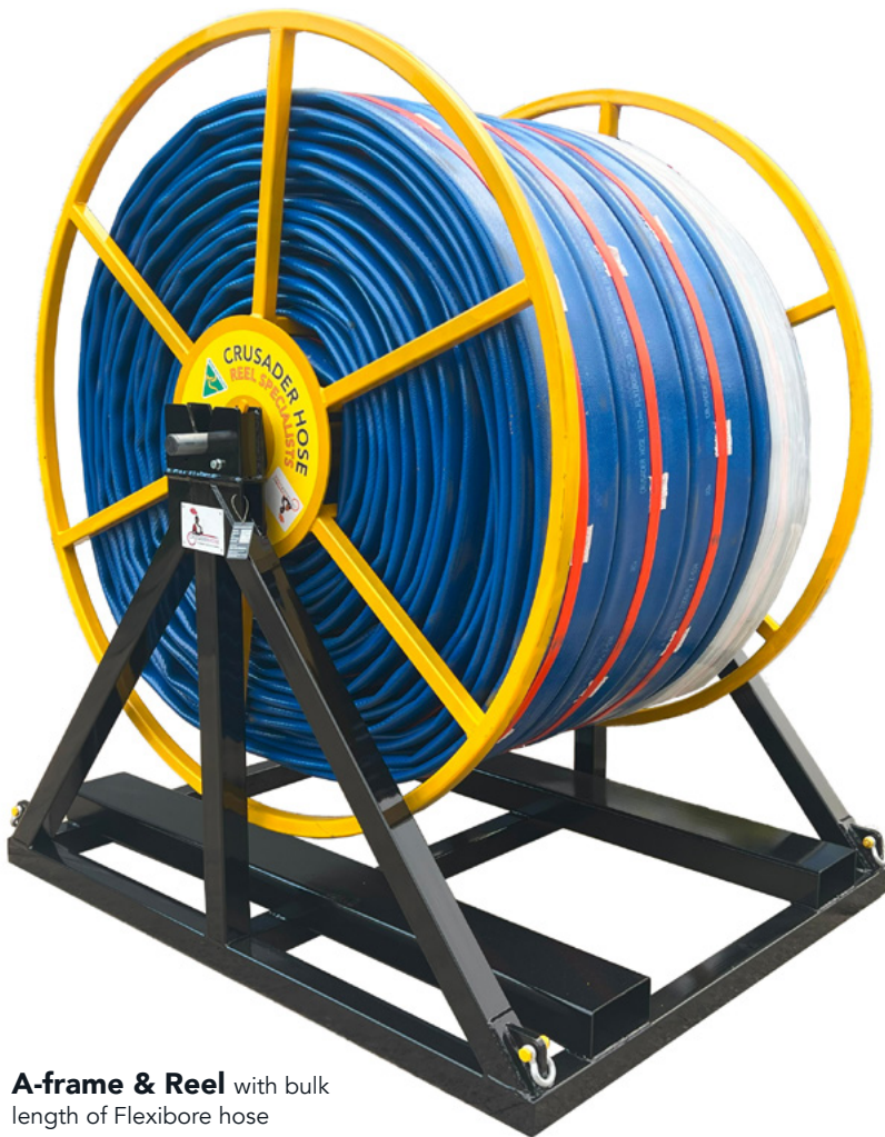
A-frame & Reel with bulk length of Flexibore hose